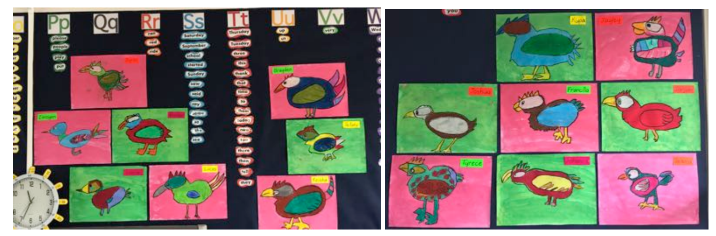
Creating Future Achievers

When they were all finished and dry, Miss Adlam hung the magpies up on our classroom wall so everyone can see and enjoy them.